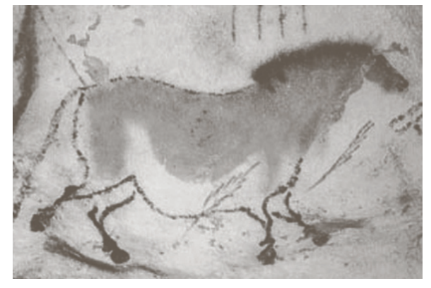
A cave painting from the French Lascaux caves which contain 16,000-year-old Paleolithic art.

You belong to haplogroup R1b , The Artisans, who first arrived in Europe from west Asia about 35,000-40,000 years ago at the dawning of the Aurignacian culture. This culture was remarkable for its subtle, yet significant, technological progress. While early