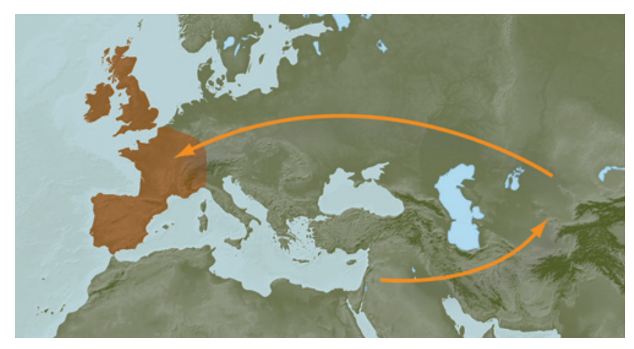
Your ancient ancestors likely traveled this path—settling for various periods of time at points along the way.

Aurignacian peoples collected flint for tools at random, they later advanced and managed their resources with sophistication, using a single stone core to shape flint tools as needed. Aurignacian decorative beads and jewelry could also be the first sign we have of the uniquely human quality of selfawareness and adornment. Additionally, some anthropologists believe that the Aurignacian culture was the first to paint. The people of this time period left behind fascinating cave paintings in France, Spain and Portugal.